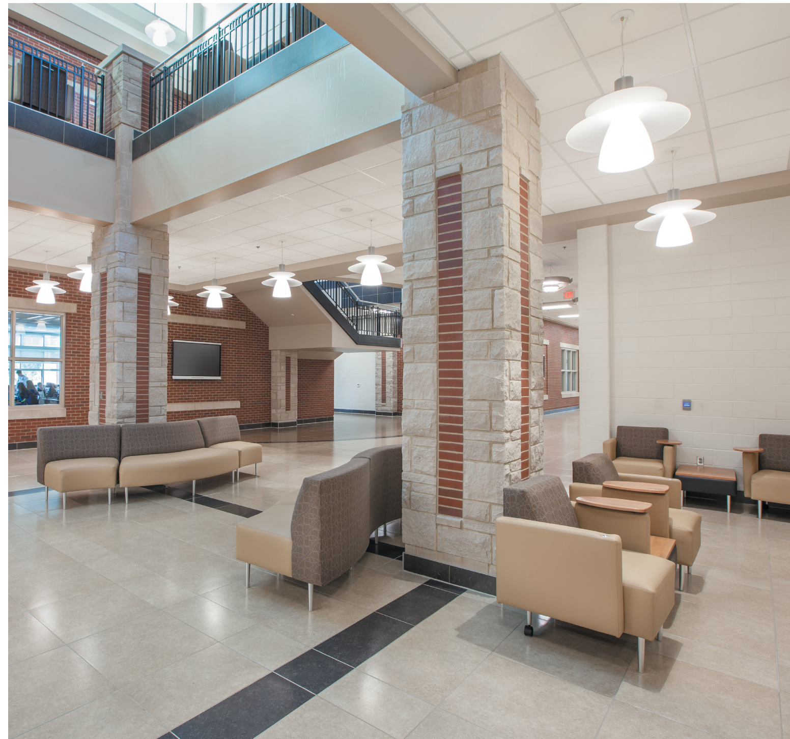
Laurel County Career Readiness, Laurel County KY | SCB Architects / STW Engineers